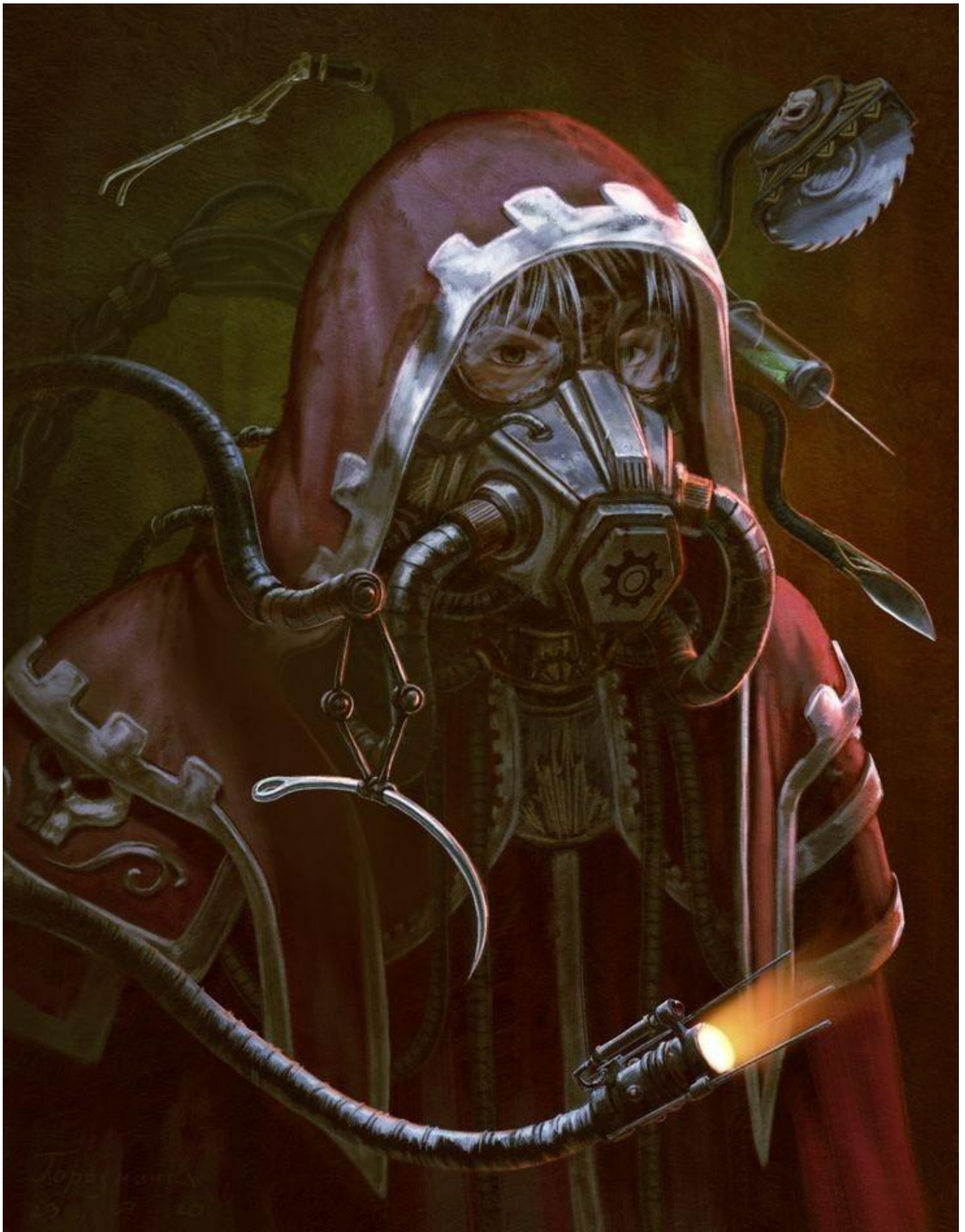
-Elevator Repairman/Infrastructure Representative in the absence of Magos Vector van Flange .